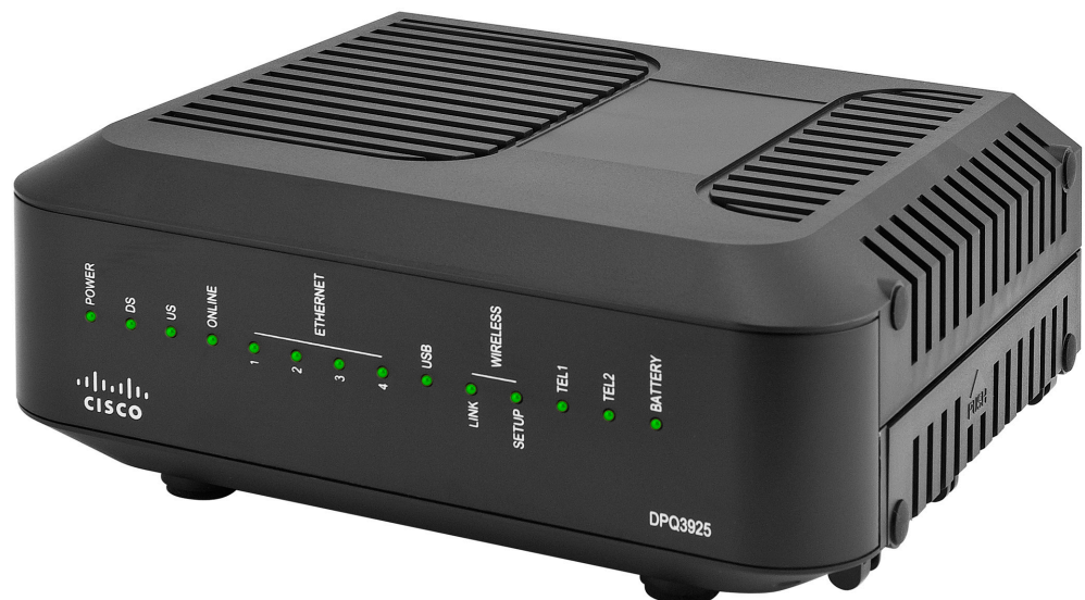
Figure 1. Cisco Model DPQ3925 8x4 DOCSIS 3.0 Wireless Residential Gateway (image may vary from actual product and specification)

The DPQ3925 is designed to meet PacketCable™ 1.5 and DOCSIS 3.0 specifications, as well as offering backward compatibility for operation in PacketCable 1.0 and DOCSIS 2.0, 1.1, and 1.0 networks.