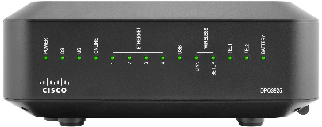
Table 1. Front Panel Features